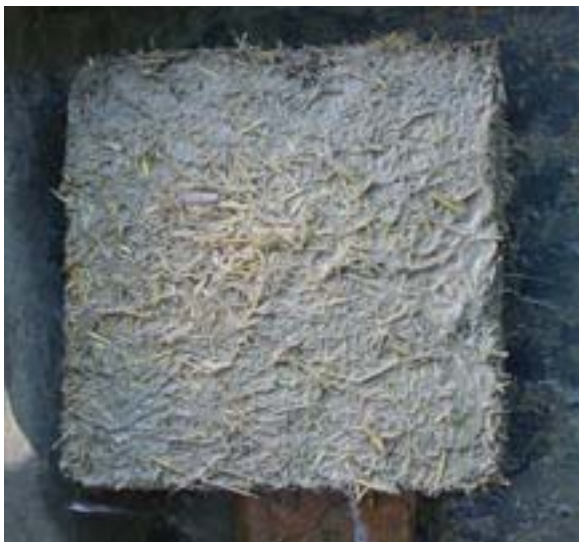
Erosion pattern of earth plaster sample A. The straw-rich block held its shape for six hours.