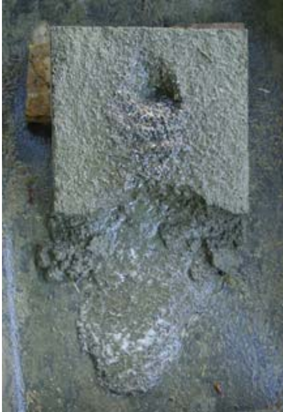
Erosion pattern of earth plaster sample G. The soil without straw reinforcement just melted away.