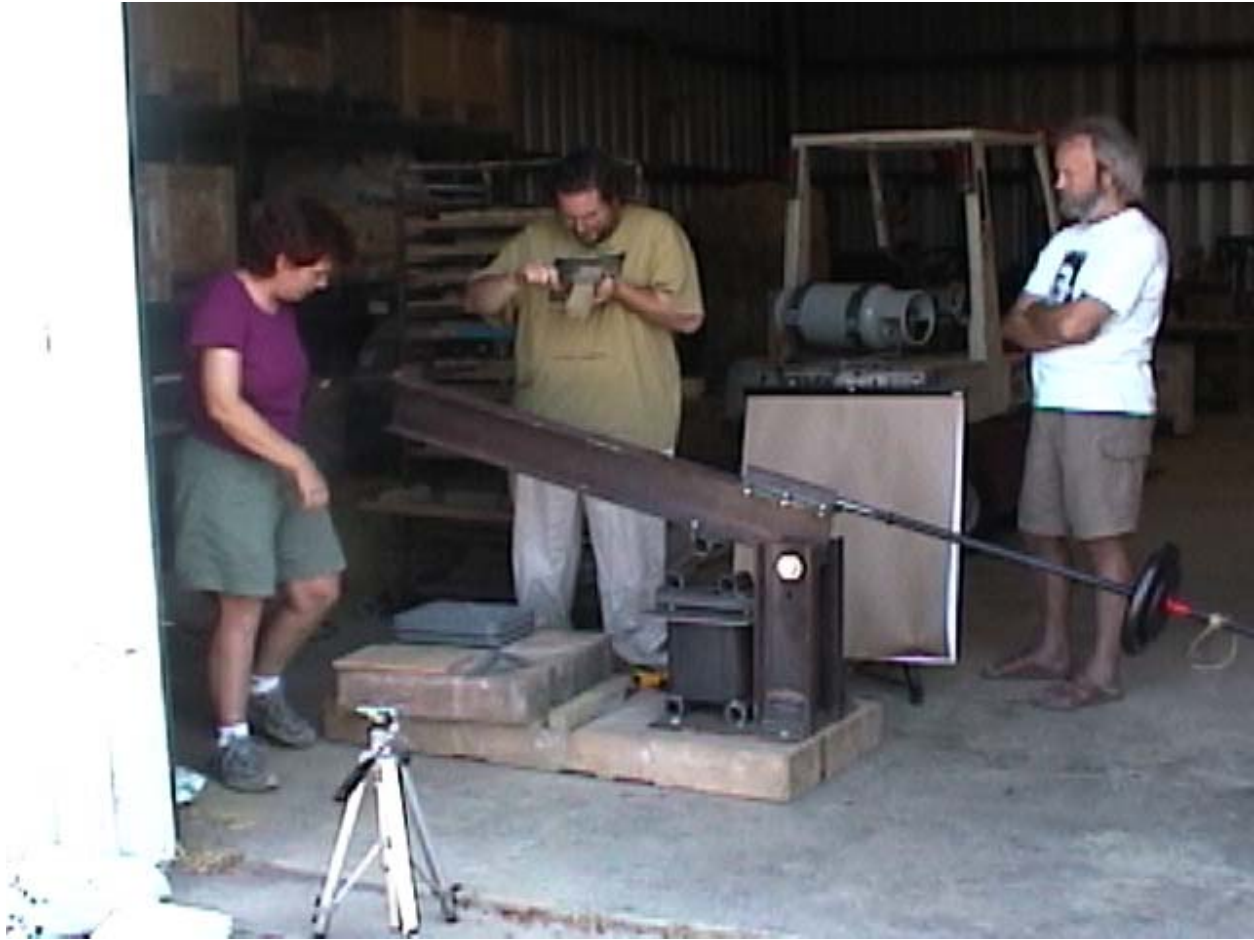
The nutcracker in the MOR configuration with counterweight installed