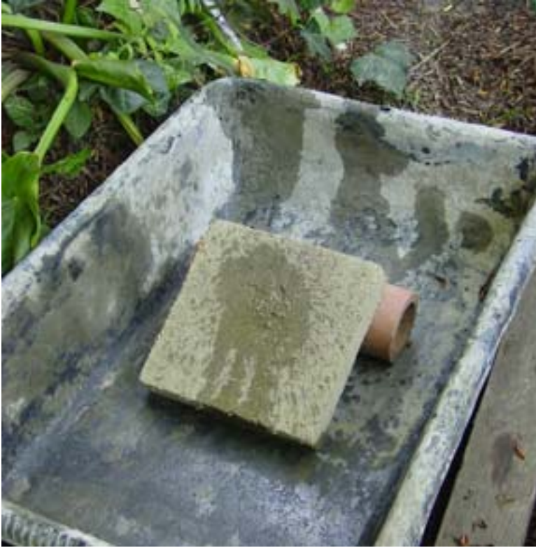
Earth plaster block, sample C at the beginning of testing.